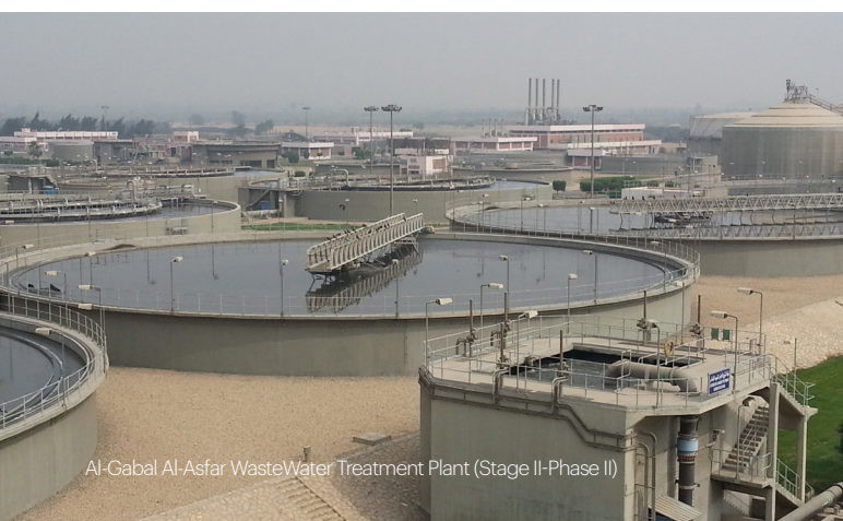
Al-Gabal Al-Asfar WasteWater Treatment Plant (Stage II-Phase II)